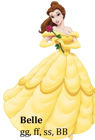
Belle gg, ff, ss, BB